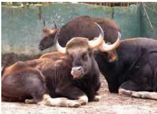
The Oxen by Thomas Hardy

There are, of course, so many festive Christmas poems to choose from but I love the wistful mood of this one and it's longing for childhood innocence; hope you do too !!